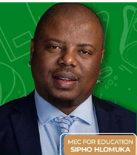
MEC FOR EDUCATION SIPHO HLOMUKA