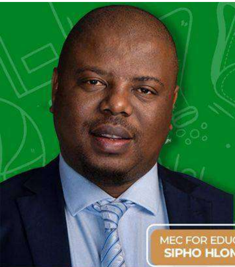
MEC FOR EDUCATION SIPHO HLOMUKA